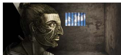
Sociologists from Aotearoa write of their various interventions in society.