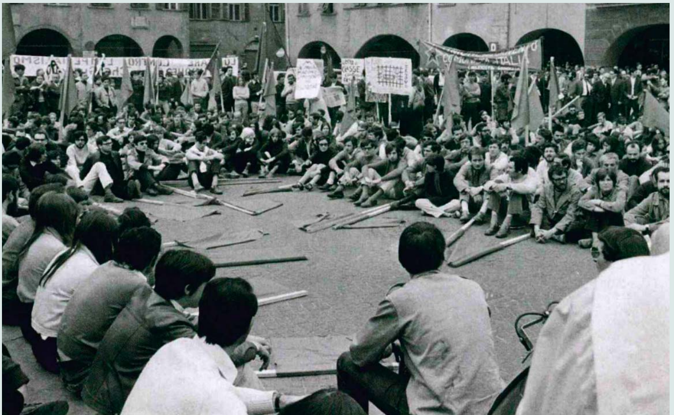
| Trento Student Revolt, 1968.