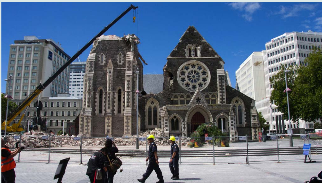
Cathedral Square, Ōtautahi (Christchurch) after the 2011 earthquake.