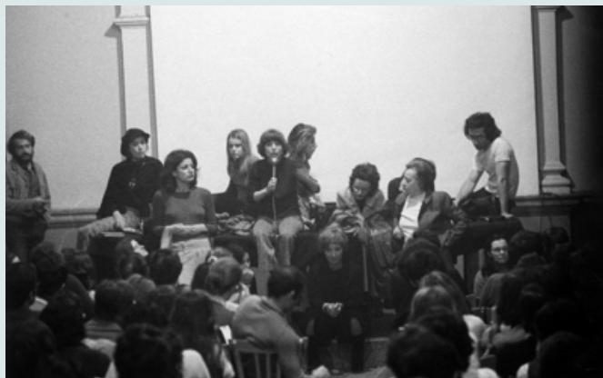
Meeting of Trento feminists in 1968.

sues like abortion and divorce. However, this close connection with political activism impeded the institutionalization of gender studies within an academic system intent on presenting itself as independent from political affiliations, and within sociology, a discipline seeking to combat accusations of political militancy and ideological goals.