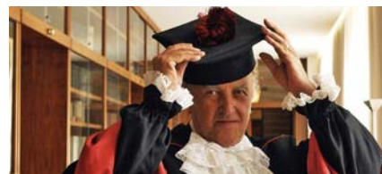
Italian sociologists discuss the battle for sociology in Italy.

> Submissions should be sent to burawoy@berkeley.edu