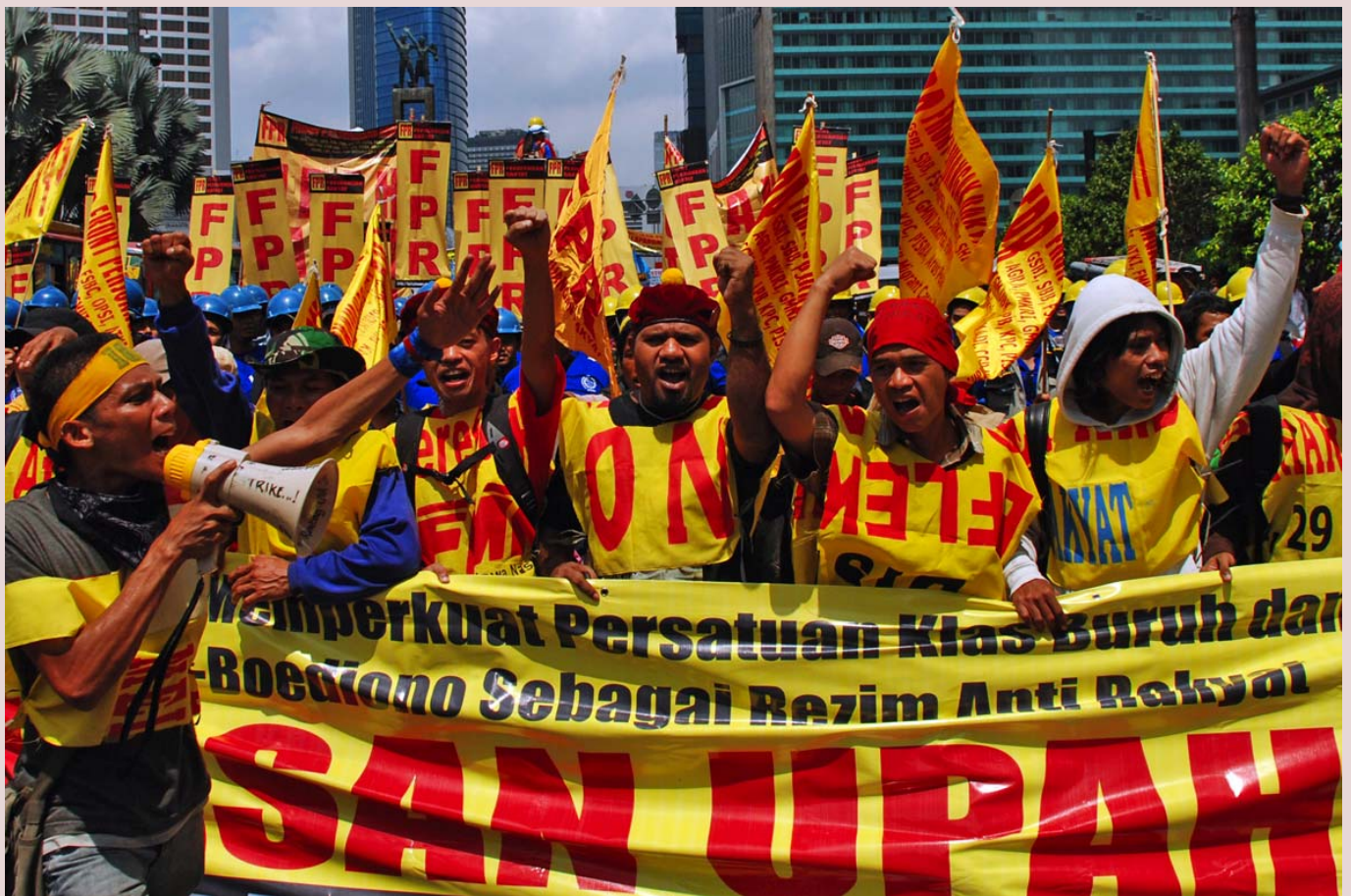
Workers demonstrating on May Day in Jakarta, calling for working class solidarity.