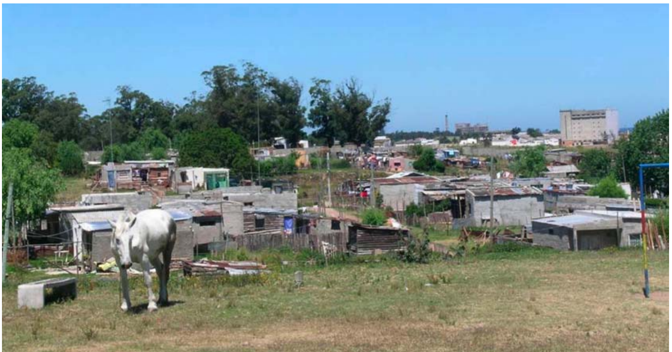
A precarious squatter settlement in Montevideo that grew on the fringes of an earlier planned occupation.