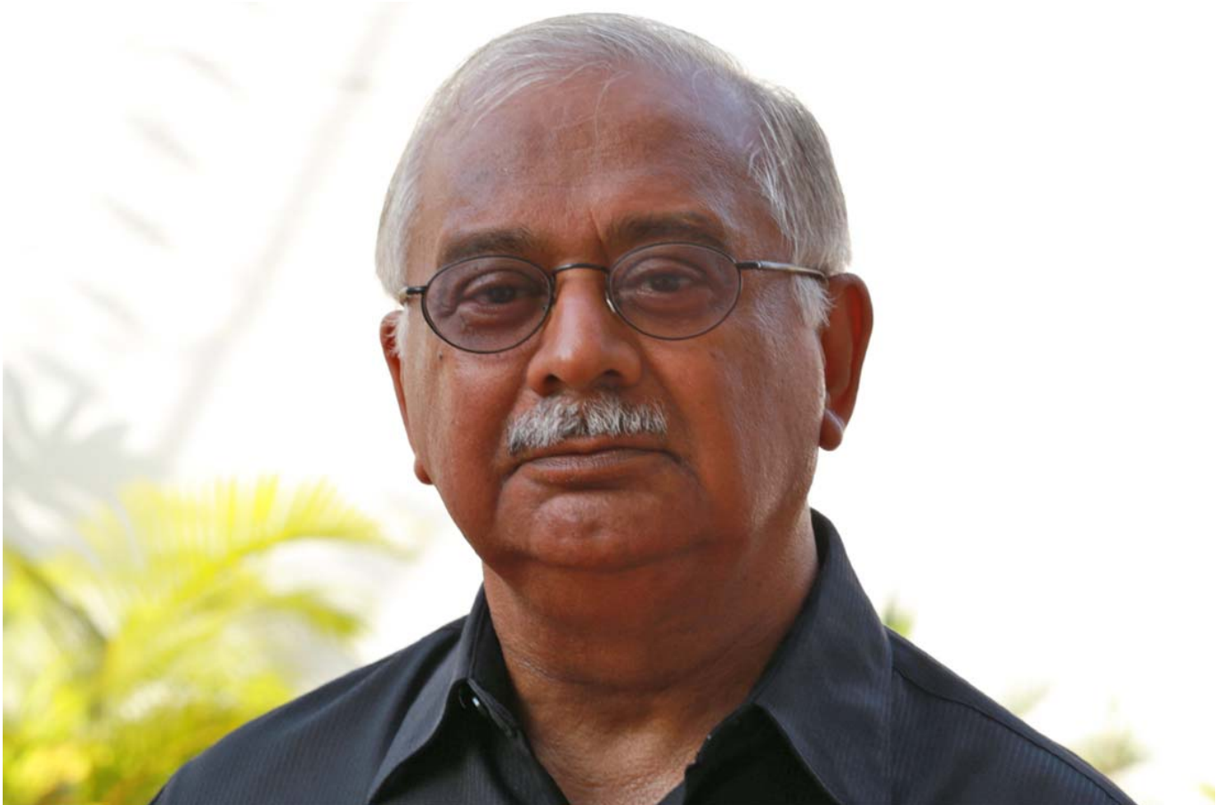
| Issa Shivji.

I ssa Shivji is one of the great public intellectuals of postcolonial Africa. He was a law student (1967-1970) at the University of Dar es Salaam, growing up amidst distinguished leftist scholars such as sociologists Giovanni Arrighi, Immanuel Wallerstein and John Saul. These scholars came from all over the world, attracted to the formative intellectual ferment at the university. Even as a precocious student, Shivji began to challenge the socialist policies of the Ujamaa regime of Julius Nyerere, the first President of Tanzania. During this early period he wrote such celebrated and widely-debated works as The Silent Class Struggle that drew attention to the social forces that were politically (un)represented in the new postcolonies of Africa. After receiving degrees from