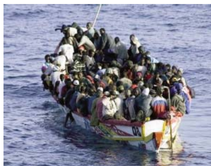
Trafficking in People.

The plenary sessions discussed the evaluation of organized crime. It should be supervised by internationally selected peers and supported by data. Most countries were in a hurry to implement the evaluation and to show concrete activities and achievements, others were reluctant to undertake immediate implementation and were concerned about the costs. Financial support is necessary and it should go from the North to the South.