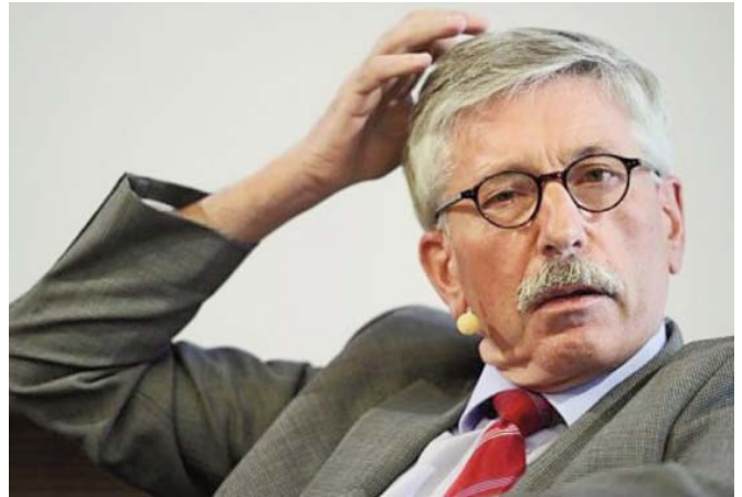
Thilo Sarrazin at the Eye of a political Storm.

In the context of today's urban space within a democratic state, it cannot be the elitist project of a cosmopolitanism from above , but rather a cosmopolitanism from below . Stuart Hall speaks about the latter and uses the concept of vernacular cosmopolitanism , which derives from the everyday experience of encounters with different cultural lifestyles and conviviality. However, Hall warns against a perception of culture as a clear-cut, single, coherent, integrated and organic set of rules and traditions: