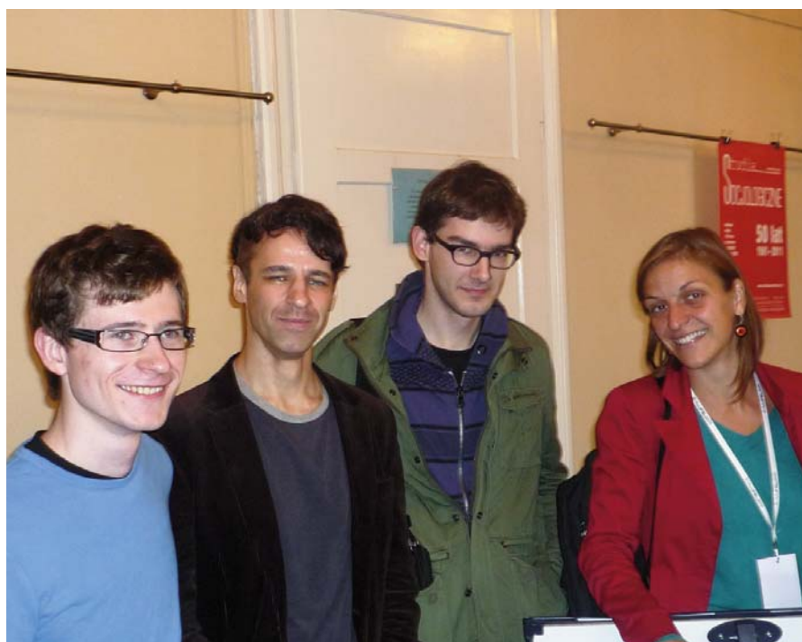
Young sociologists at a recent meeting of the Polish Sociological Association.

The biggest project led by the Section during the last three years involved ‘Moving Workshops’. To date we have had 6 meetings with around 125 students and 25 senior scientists participating. At the basis of the project was an observation that sociology, as a scientific discipline, differs at each university. Moving Workshops last two days: 15 to 30 students from various universities come to one institute of sociology to learn from the academic staff there. The meeting is organized by students from a scientific circle, who invite their professors. All activities are concentrated around one leading theme and the program of each meeting must include a theoretical introduction as well as practical