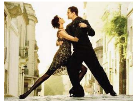
We're off to Buenos Aires!

It is my pleasure to announce that the ISA Executive Committee has selected Buenos Aires, Argentina to host the ISA Forum 2012 (August 1-4). In the interests of openness, the Executive Committee of the International Sociological Association sent out a call for bids to RCs, WGs, TGs, and NAs for the site of the ISA Forum of Sociology in 2012 with a submission deadline of November 15 th 2010. We received eight