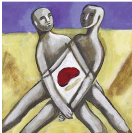
Organ transplants - A symbol of Cosmopolitization.

In the cosmopolitanized body, scapes, continents, races, classes, nations and religions all become fused. Muslim kidneys purify Christian blood. White racists breathe with the aid of one or more black lungs. The blonde manager gazes out at the world through the eye of an African street urchin. A secular millionaire survives thanks to the liver carved from a Protestant prostitute living in a Brazilian favela. The bodies of the wealthy are transformed into patchwork rugs. Poor people, in contrast, have been mutilated into actually or potentially one-eyed, one-kidneyed spare-parts depots, and this has occurred 'by their own free will', and 'for their own good', as the affluent sick constantly reassure themselves. The piecemeal sale of their organs is their life insurance. At the other end of the process, the bio-political 'citizen of the world' emerges – a white, male body, fit or fat, with the addition of an