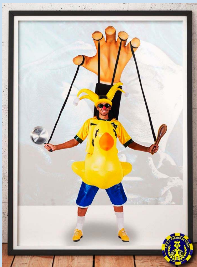
"Manifestoche": Carnival figure of the Samba School Paraíso do Tuiuti manipulated by São Paulo's Bourgeoisie, Brazil Carnival 2018.