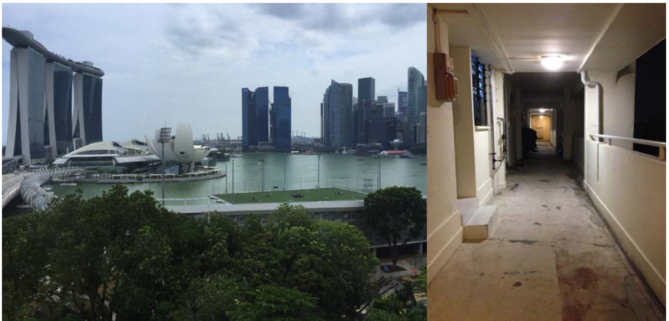
Contrasting realities in Singapore.