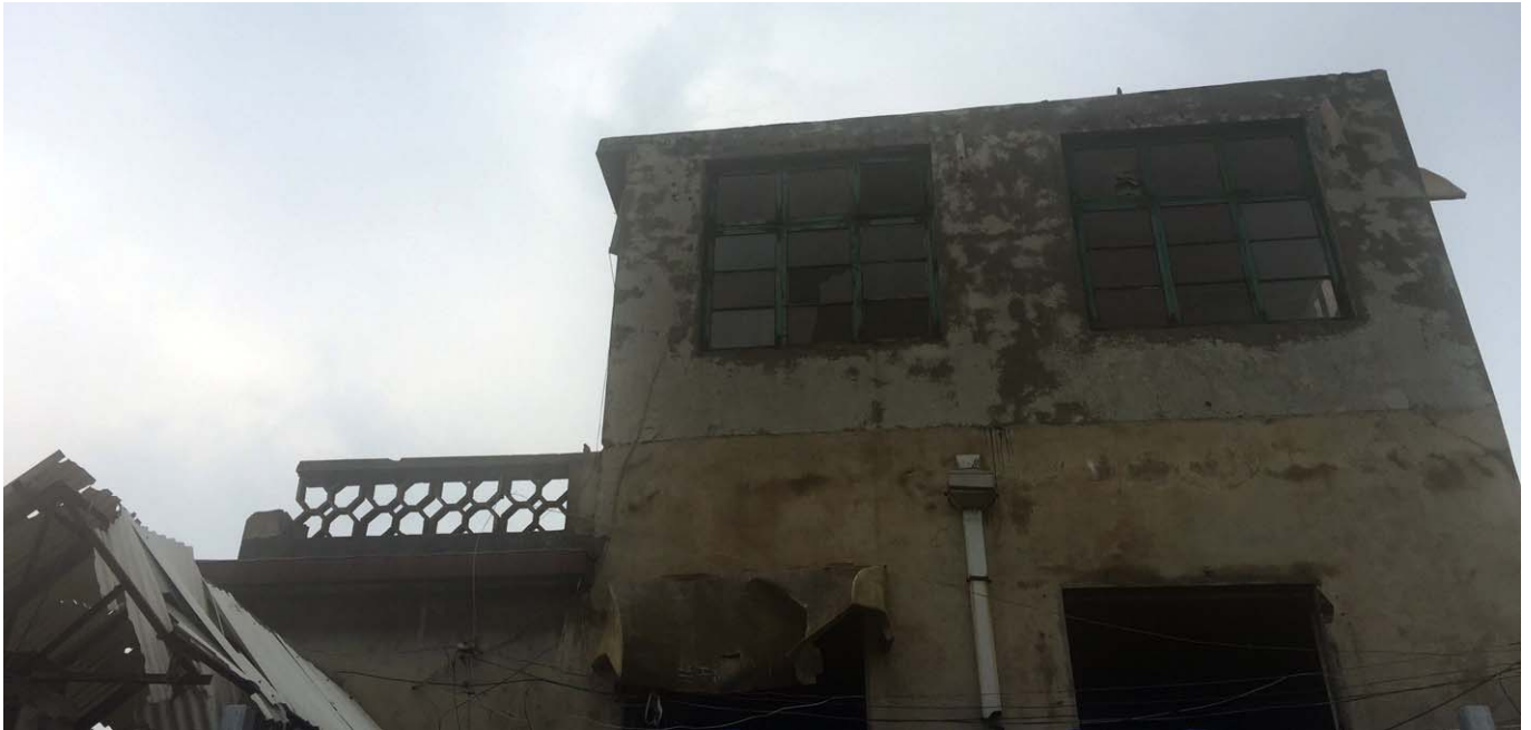
A half-demolished nail house in an urban village in East China, June 2017.