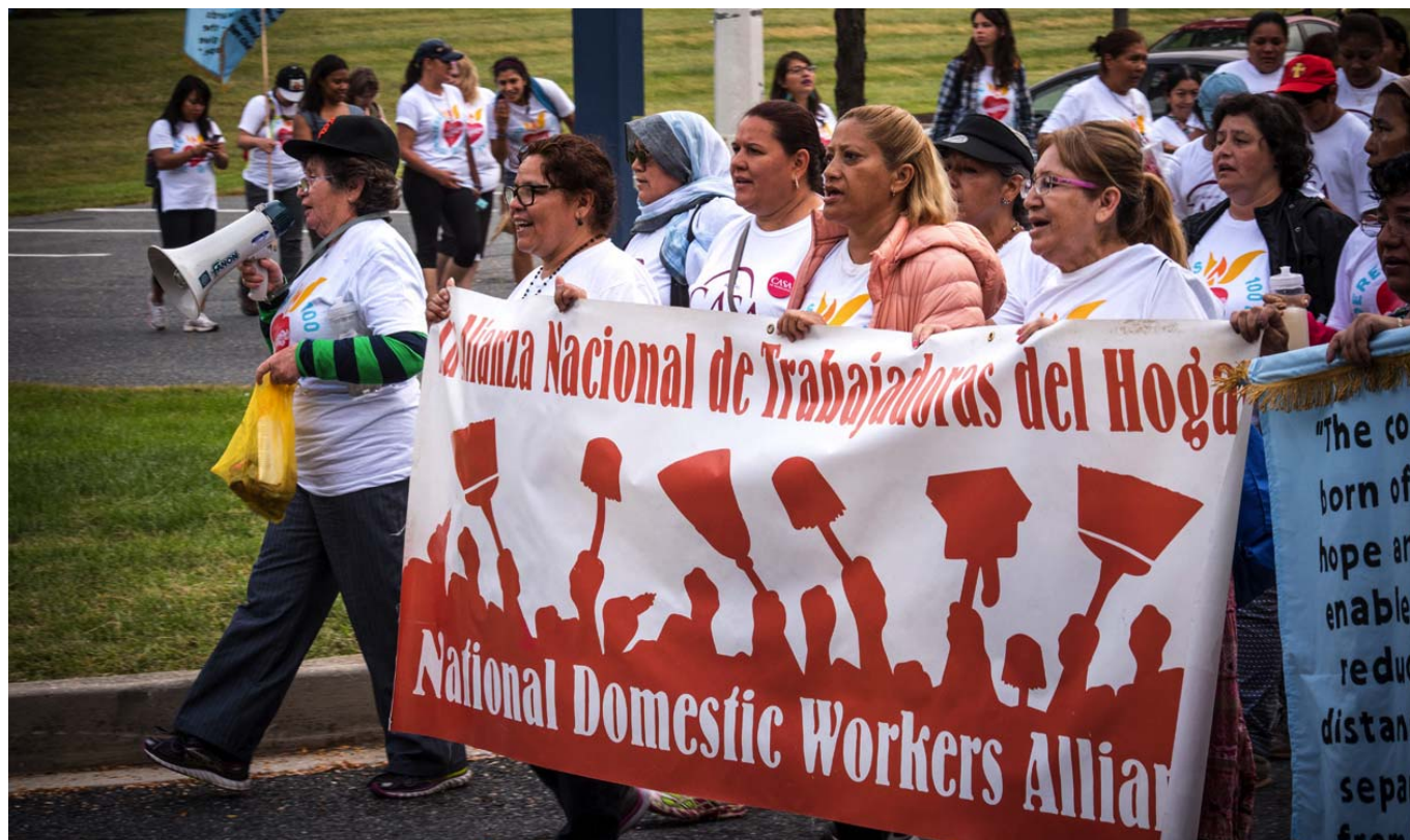
National Domestic Workers Alliance (NDWA): Pilgrimage to the Pope, September 2015.

literatures, including those examining resource mobilization, political opportunity structures, identity, and framing.