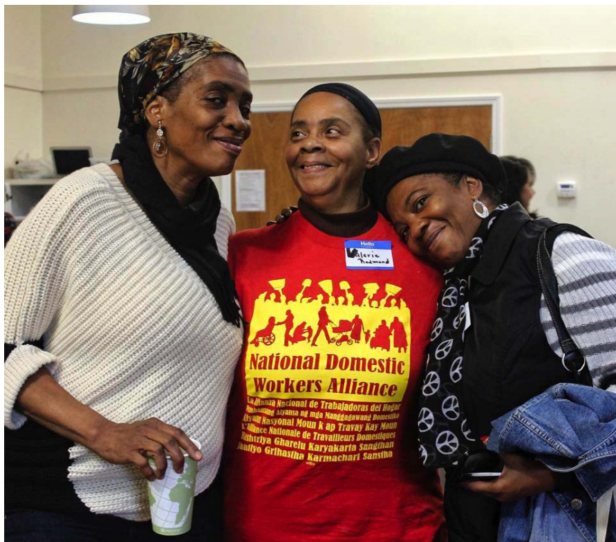
National Domestic Workers Alliance (NDWA): Chapter leaders, December 2015.