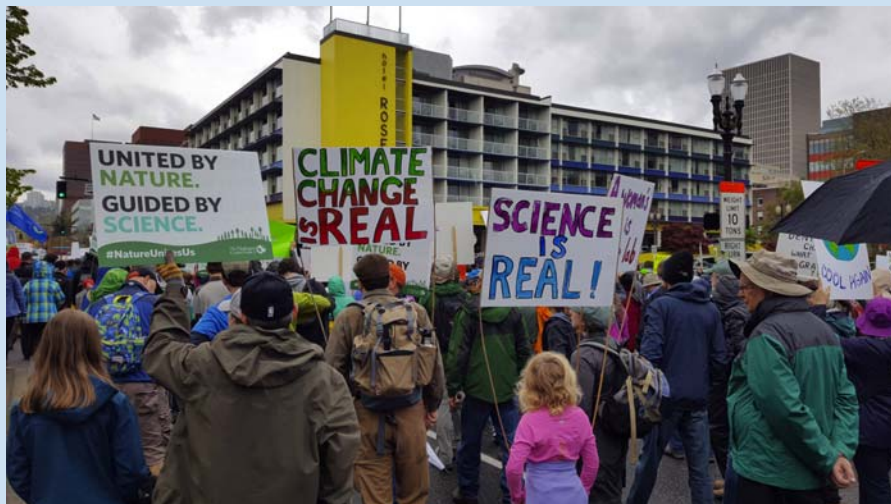
Portland March for Science, Portland, USA, 2017.

funding by identifying potential sponsors who might benefit from these activities. The successful applicant could expect a 50% bonus over and above the base salary of $140,000 if the Key Performance Indicators of media engagement and fund raising were met.