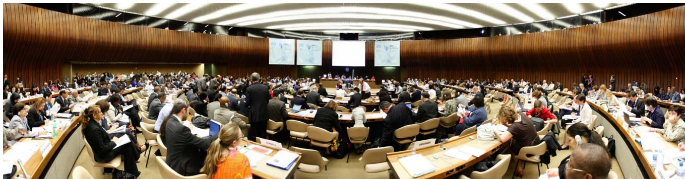
ILO Conference committee for Convention No. 189, 2011.

movement by domestic workers is a remittance-based strategy associated with a neoliberal approach to economic development anchored in temporary migration.