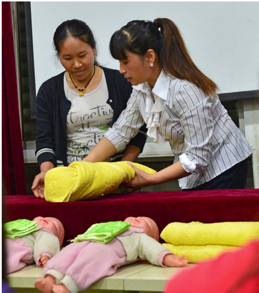
Training session for care workers.

by Pei-Chia Lan , National Taiwan University, Taiwan, and member of ISA Research Committee on Sociology of Migration (RC31)