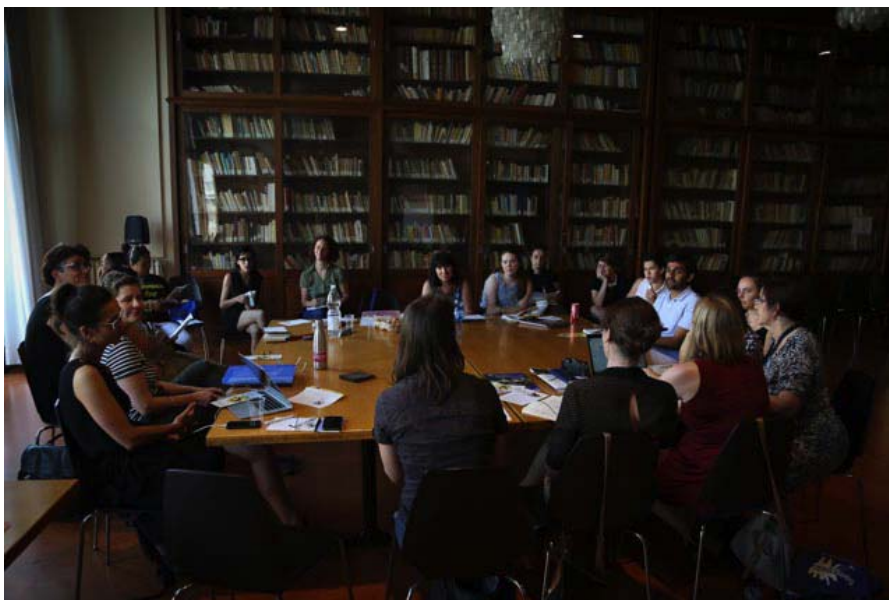
Meeting of the network in Venice, Italy, June 2017.