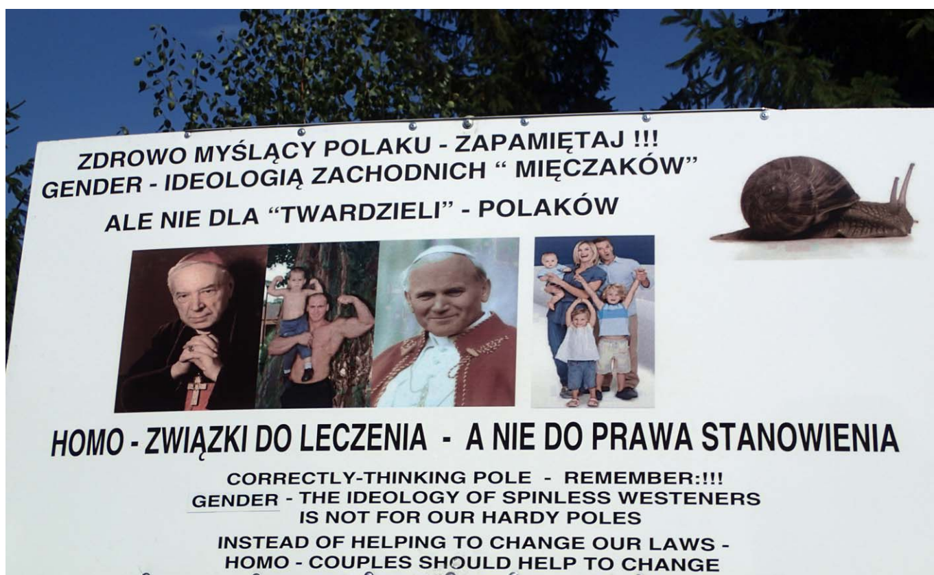
Banner at the Anti-Gender Rally, August 30, 2015.