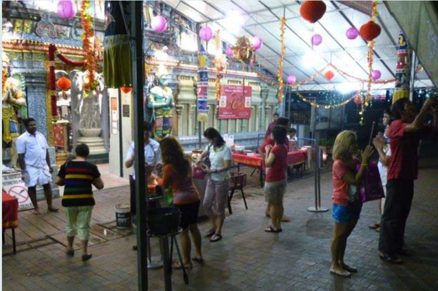
Chinese devotees of the Guanyin Temple offering joss sticks at the neighboring Sri Krishnan Temple.