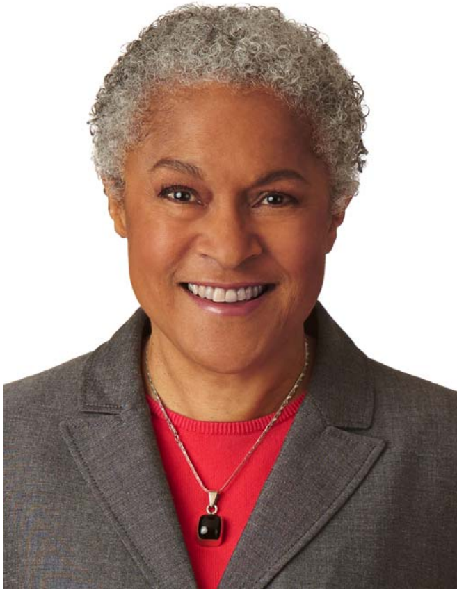
| Patricia Hill Collins.