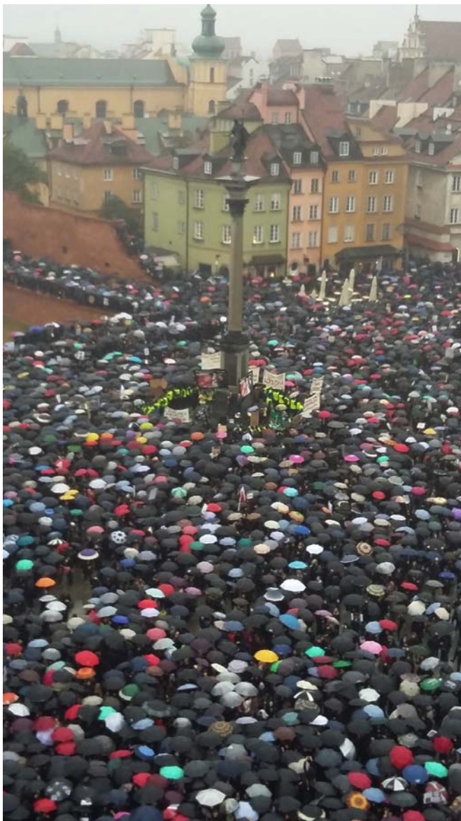
Polish women in Warsaw protesting against new abortion law, October 3, 2016.