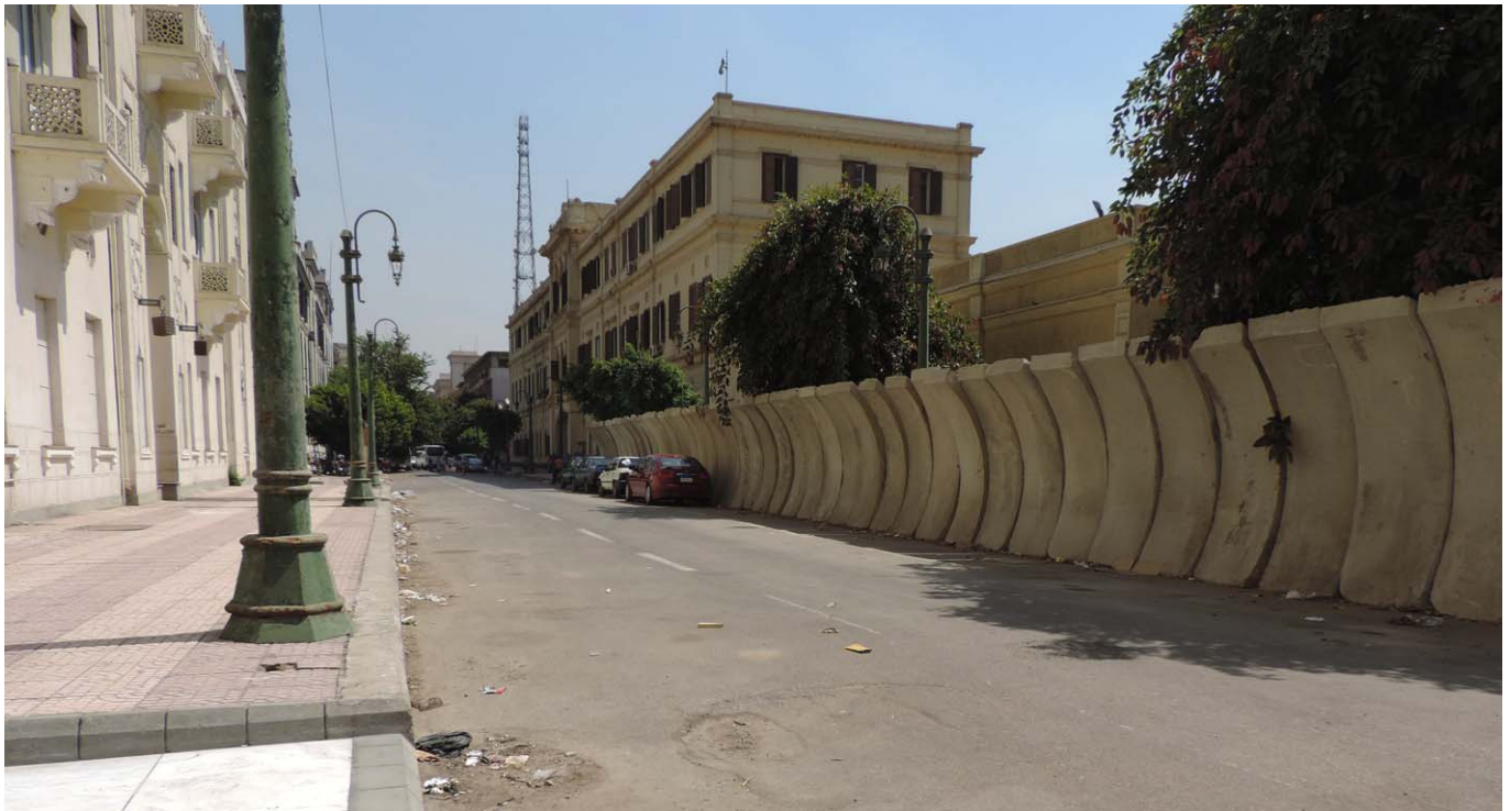
The newly created concave wall, erected opposite the entrance gate to the American University in Cairo.

from the Emirates. 4 Then the Cairoobserver informs us that in 2014 the Defense Ministry signed an agreement with Emaar, the mega company based in the UAE, to construct a huge Emaar Square that would include the largest shopping center in uptown Cairo, counterposing to Tahrir Square a neo-liberal market oriented to Dubai.