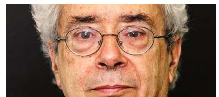
Luc Boltanski , the great French theorist of the sociology of critique, talks about his latest book on detective novels and their significance for sociology.