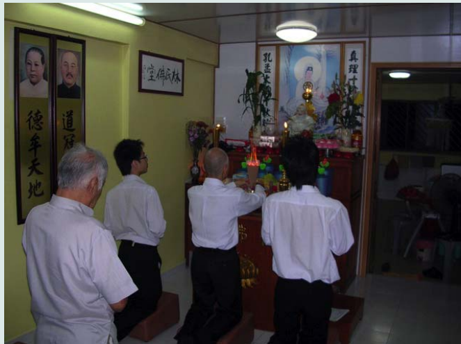
Devotees worshipping at a home temple in a public housing flat.