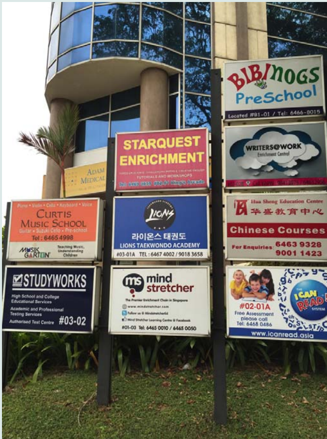
In contemporary Singapore, “enrichment” and “tuition” centers are an increasingly common sight.