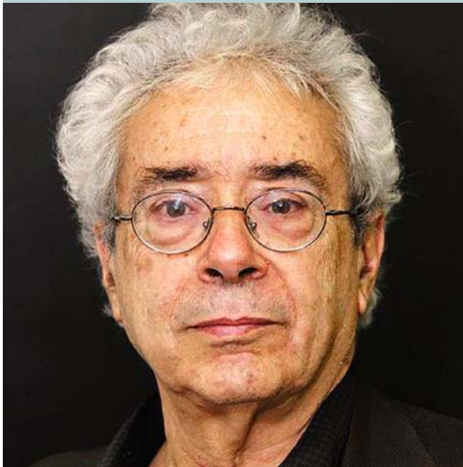
| Luc Boltanski.