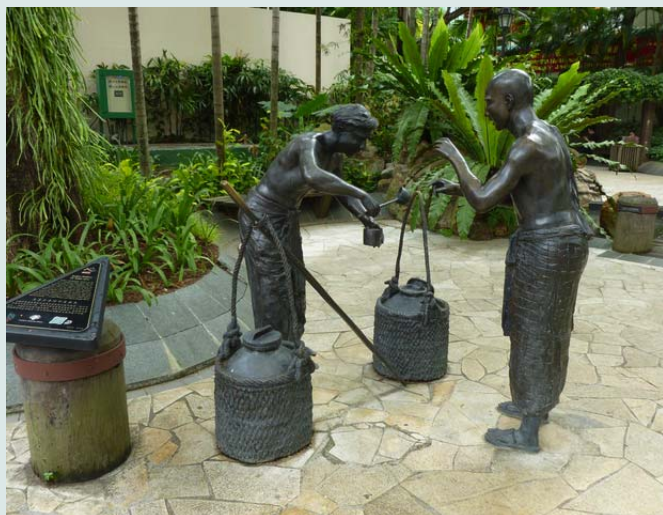
Sculpture of Malay and Indian traders at the Telok Ayer historical site in present-day Chinatown district of Singapore.