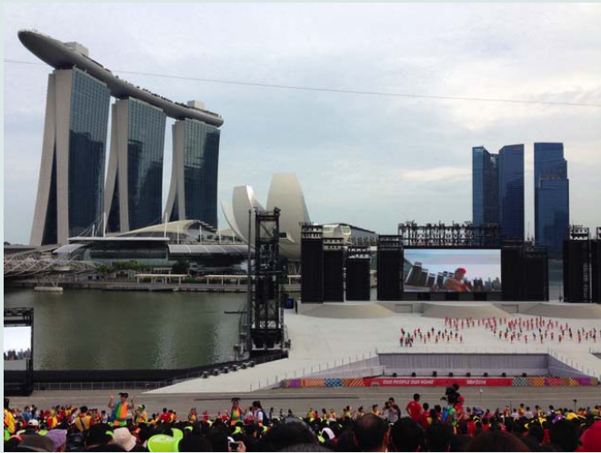
Rehearsals for the National Day Parade at the Marina Bay floating platform.