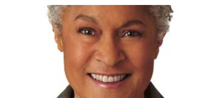
Patricia Hill Collins , leading African-American feminist shares her original ideas on intellectuals and marginality.