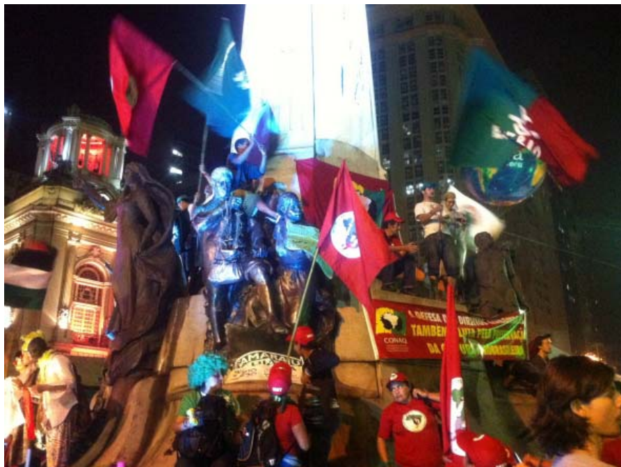
Protesters with the People's Summit take over the Plaza Floriano in Rio de Janeiro's historic downtown, around 40 kilometers away from the official summit venue.

and government, made it difficult to leave the conference without thinking of it as a glossy, well-orchestrated sales pitch by science bureaucrats and scientists wanting a share of the increasing sums of money that governments and businesses have begun to allot to social- and geo-engineering projects for “adapting” to and “managing” the environmental crises.