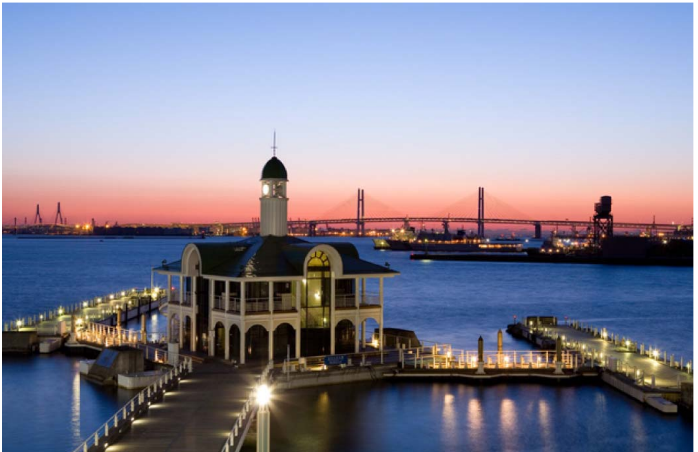
Yokohama Bay Bridge and the Floating Pier as seen from the Congress Venue, Pacifico Yokohama.