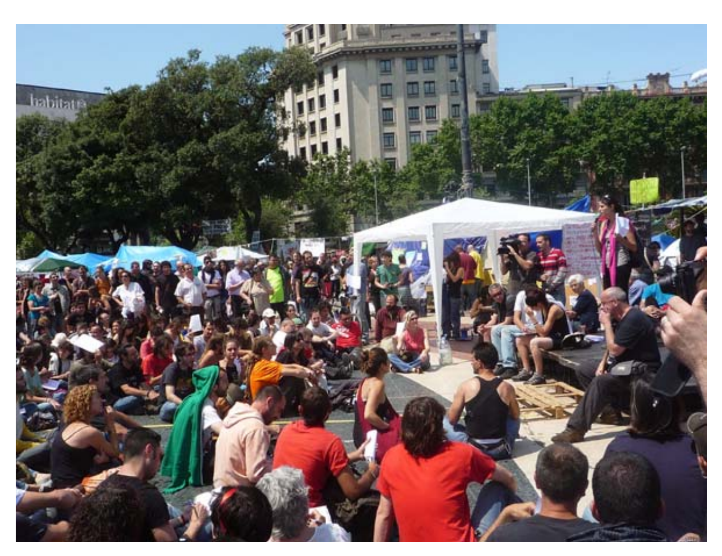
Catalunya Square, Barcelona - General Assembly in Session.

This 'real democracy' is promoted, disseminated and expanded through social networks, largely based on Facebook, Twitter, various blogs, the web, and an online forum. The web page publishes, 24 hours in advance, the minutes of all the commissions as well as all the important topics that will be voted on in the General Assembly. In the online forum there are debates that parallel the ones in the square. The people themselves decide on the most important issues that face the movement. This was the case, for example, in the decision to continue mobilization in spite of the ruling of the Supreme Court and the Constitutional Court in favor of the removal of the camp.