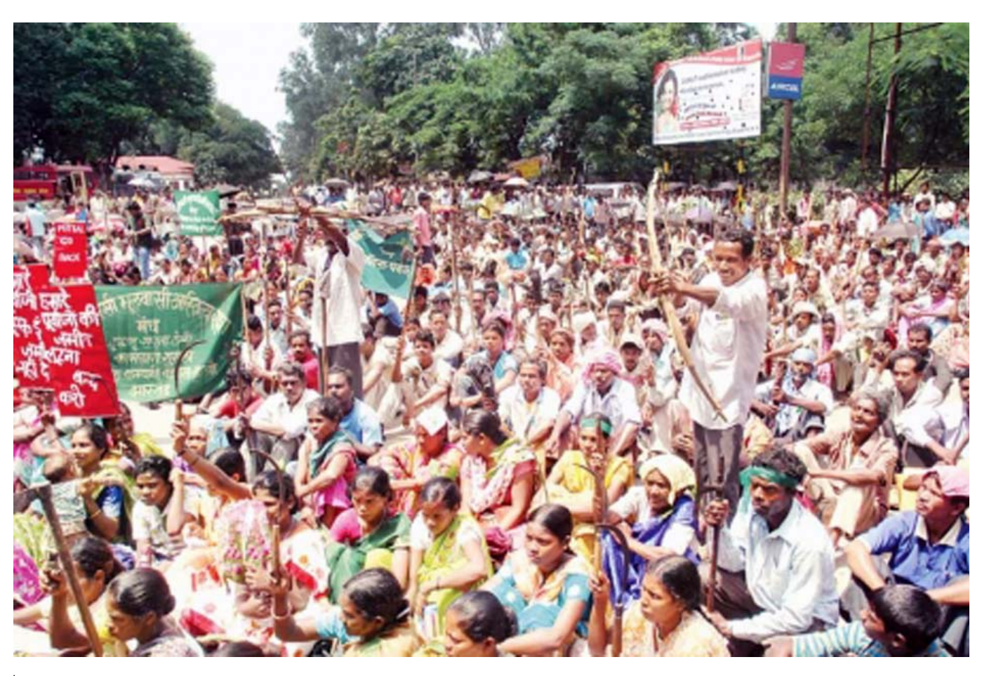
Adivasis protesting in front of the governor's house against displacement in Jharkhand.