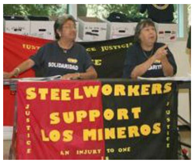
Canadian Steel Workers support Mexican Miners and Metal Workers.

In the case of Latin America, the problems are similar to the ones noted by Webster. In every case, it is necessary to specify the importance of the informal sector, which is not generally subject to labor regulations. According to the new definition of the International Labour Organization, the percentage of workers in Latin American countries occupied in informal occupations or lacking labor protections in formal companies ranges from 40 to 70% of the labor force. The informal sector includes large companies as well as small ones, but it is especially prominent among companies with fewer than five workers. Such micro-entities constitute the majority of companies in all the countries of Latin America. In this sector part of the workforce is wage-earning, but many are self-employed or work without pay in family companies. Employees paid via commission should also be included in this sector. At this moment, the struggles for labor regulation in this sector are very important. The position of workers in international value chains is also an issue, posing the question of the relation between core workers and groups of subcontracted workers.