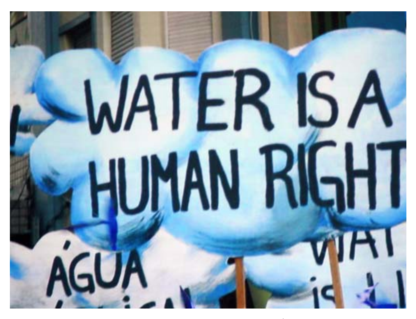
Demonstration against Water Privatization at the World Social Forum in 2003.