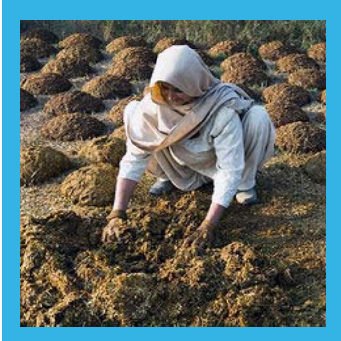
| Cowdung Sampling.

just heard from one of my former students who is working in Juba, South Sudan, who wrote: "I am trying to explain the 'snowball' technique of sampling, which is a nightmare for Africans who have no clue what a snowball is.